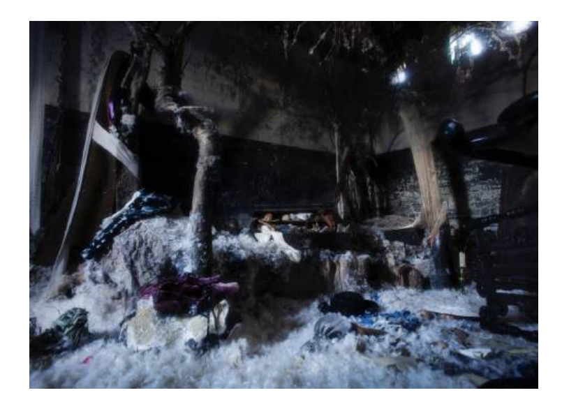
The Reverend Lovelace Bigg-Wither C-type print Framed: 178.3 x 119.85 cm Unframed: 177 x 118.55 cm Edition 1 of 5 + 2 AP