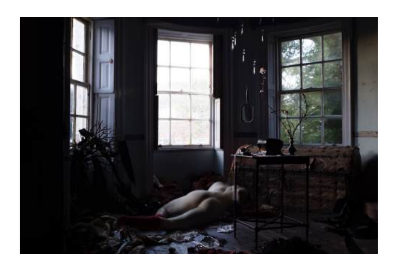
Lady Wymmering C-type print Framed: 88.2 x 67.9 cm Unframed: 87.2 x 66.9 cm Edition 1 of 10 + 2 AP