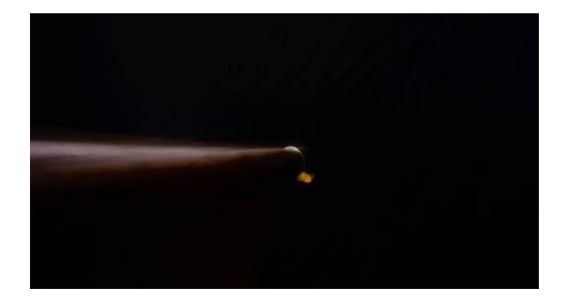
Under your chin C-type print Framed: 102.2 x 65.3 cm Unframed: 101.2 x 54.3 cm Edition 1 of 10 + 2 AP