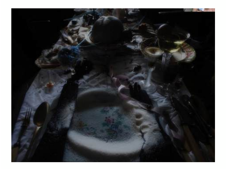
Supper time C-type print Framed: 82.2 x 58.5 cm Unframed: 81.2 x 57.5 cm Edition 1 of 10 + 2 AP